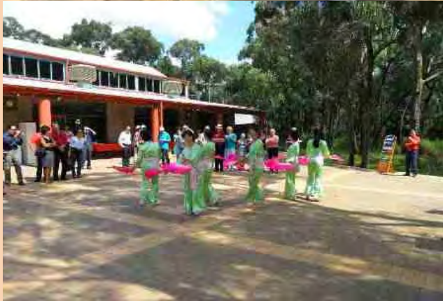
The new Courtyard was officially opened on 12 th