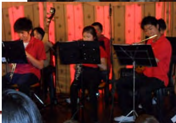
School Orchestra at Knox Festival