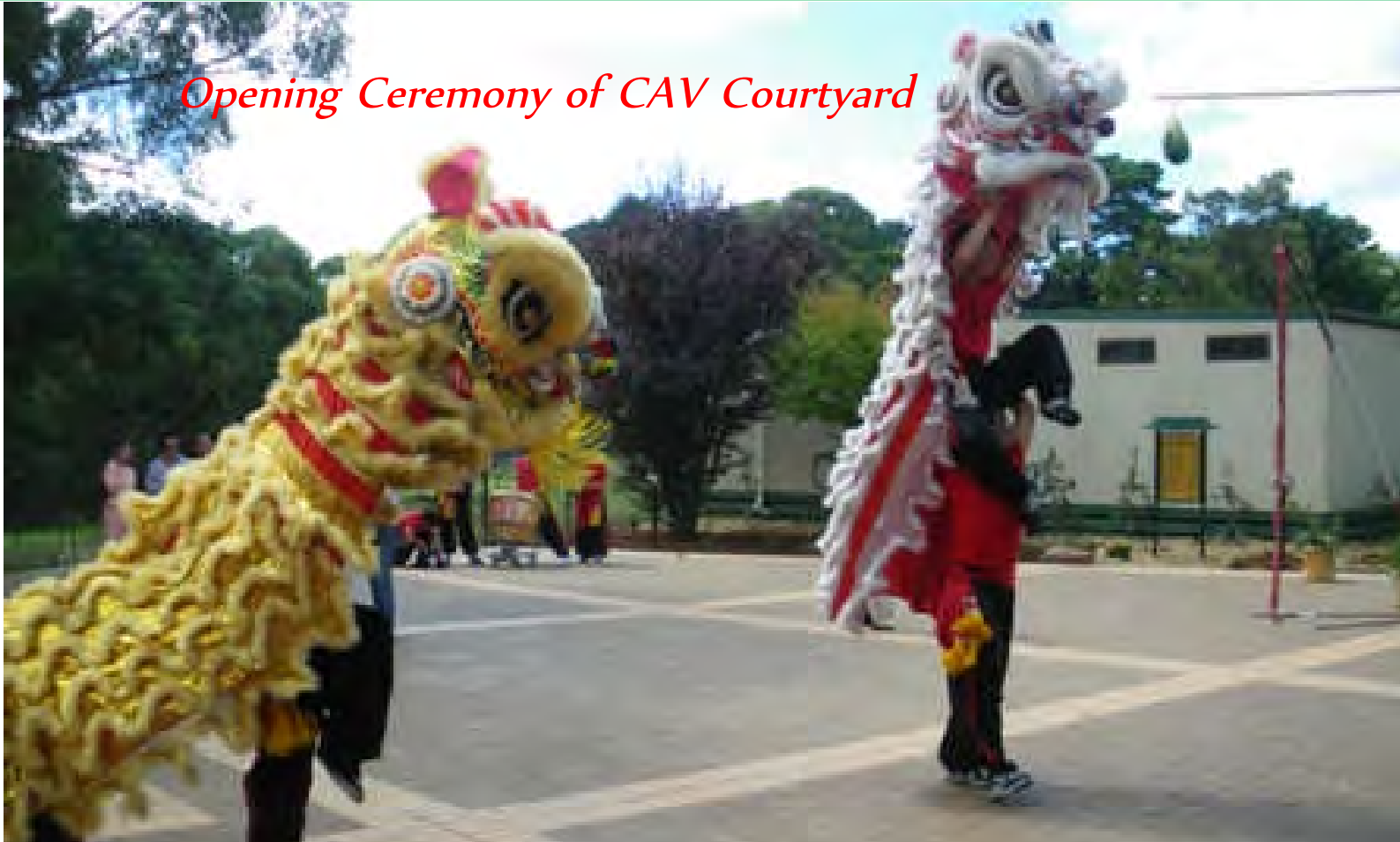
Opening Ceremony of CAV Courtyard