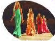
Fashion Parade by Melissa M Boutique